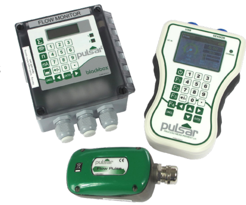
FlowPulse Optional Controllers

Optionally, there is also the Flow Monitor for fixed installation and the FlowPulse Handheld Controller for portable measurement requirements. Alternatively, the Greyline DFM 6.1 and Greyline PDFM 6.1 are suitable packages for pipe flow Doppler measurement. Please see the website or product brochures for more details.