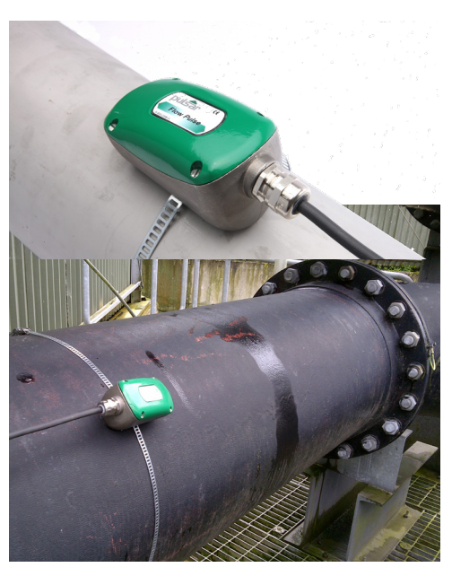
FlowPulse on a real life application